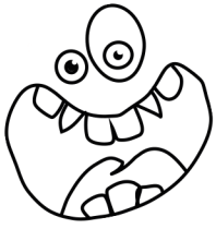
FIGURE OF GLU