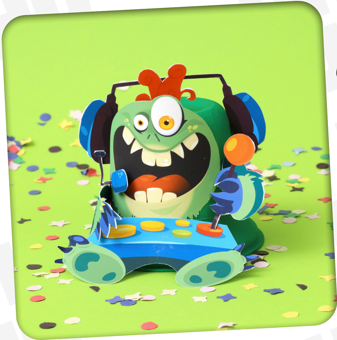
FIGURE OF GLU